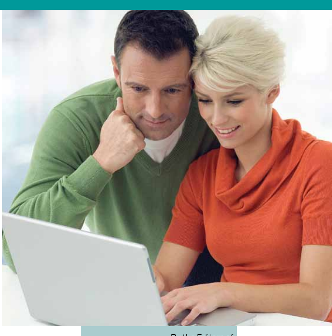
By the Editors of Kiplinger's Personal Finance